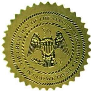
PHIL BRYANT GOVERNOR

DONE in the City of Jackson, on the 22 nd day of May in the year of our Lord, two thousand and nineteen, and of the Independence of the United States of America, the two hundred and forty-third.